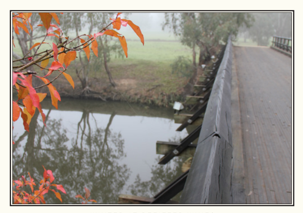
WINTER AT PFEIFFER WINES