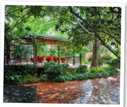
Pod Food Canberra