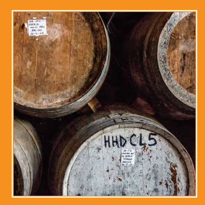
Long term barrel maturation of our precious Muscats.