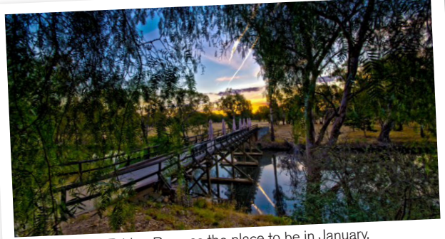
The Bridge Bar was the place to be in January.

Blue Sky, Vibrant, rich Colours, Warm Days, Cool Nights, Fine Wine, Outdoor Music, A Gathering of Family and Friends -An Autumn Easter at Pfeiffer Wines.