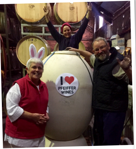
Easter 2015 was 'eggscellent'.