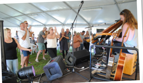
Our inaugural Food Wine and Music Festival was a HUGE success in March.